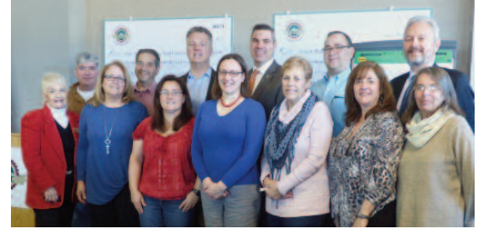
5K RUN COMMITTEE

Chamber members make great events happen when they bring their talents, skills and enthusiasm to MRCC committees. Many MRCC events raise funds for local charities.